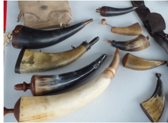
(Above) Finished Powder Horns varying in size and shape.