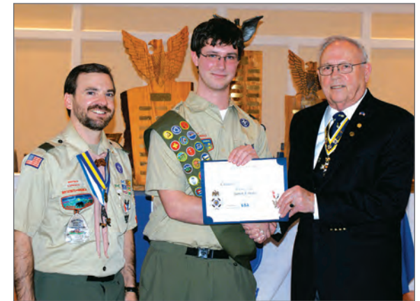
Eagle Scout Court of Honor recognition by the Sons of the American Revolution.

The SAR and the Boy Scouts participate in many activities together. Scouts of all ages can help during SAR parades and ceremonies including grave markings and Revolutionary War battle ceremonies. SAR members contribute to Scouting activities by teaching relevant merit badges, such as American Heritage, Genealogy, Law, Citizenship in the Community, Citizenship in the Nation, and Citizenship in the World.