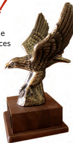
State Winner Trophy

LIST OF STATE CHAIRS, ANCESTRY CHARTS, COMPLETE RULES AND ALL FORMS CAN BE FOUND AT WWW.SAR.ORG