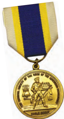
Chapter Winner Medal

Original patriotic theme of not more than 500 words