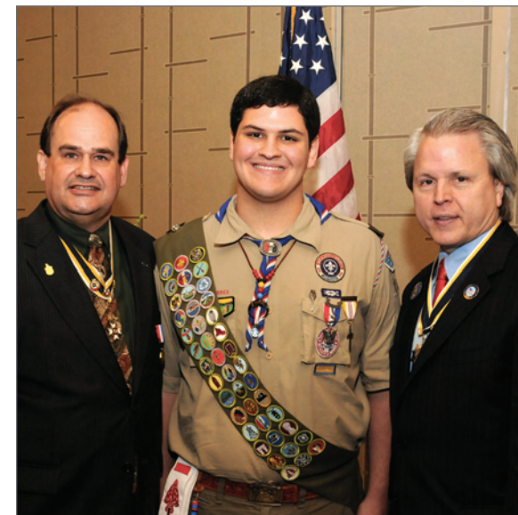
2014 SAR Eagle Scout Scholarship Winner