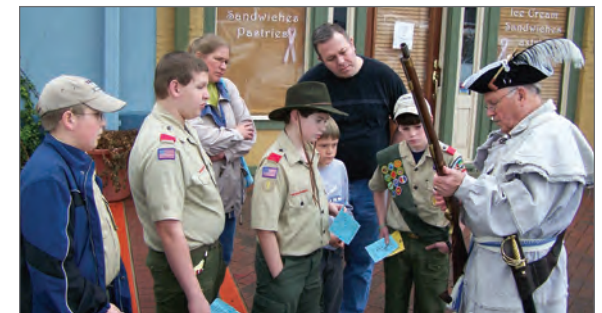
Scouts observing musket demonstration during Washington, Georgia, ceremonies.

The SAR and the Boy Scouts participate in many activities together. Scouts of all ages can help during SAR parades and ceremonies including grave markings and Revolutionary War battle ceremonies. SAR members contribute to Scouting activities by teaching relevant merit badges, such as American Heritage, Genealogy, Law, Citizenship in the Community, Citizenship in the Nation, and Citizenship in the World.