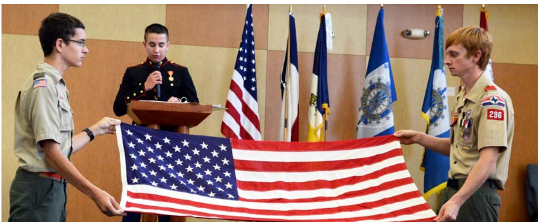
L eft: Boy Scouts of McKinney held a Flag Retirement Service which was jointly sponsored by SAR and DAR.. Here they are demonstrating the proper way to fold a flag. The program was attended by a large number of veterans who received SAR Military Service Awards.