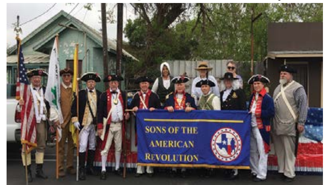
The Texas Compatriot