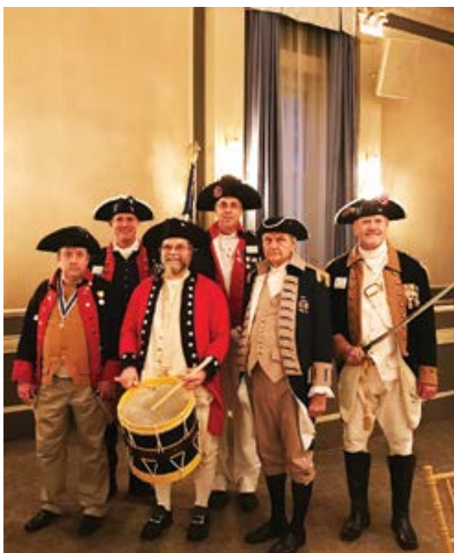
The Texas Compatriot