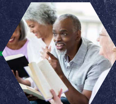
SPECIAL INTEREST GROUPS