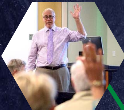
WIDE VARIETY OF FUN COURSES