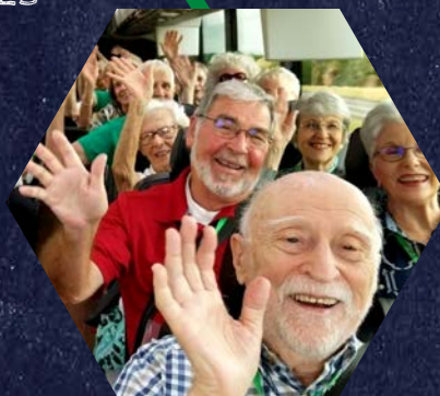
LOCAL EVENTS & EXCURSIONS