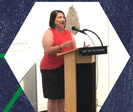
EXCLUSIVE & UNIQUE LECTURES