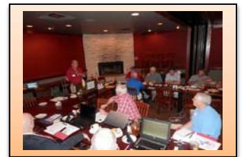
Dist.6 North Texas Confab

All three District Chapters worked on regular SAR projects and programs. These included everything from Community Service Awards, Veterans Affairs & Recognition, New Member Recruitment as well as Public Awareness Events * to * New Citizens Patriotic programs, Youth History Education/Contests, Coordinated DAR and CAR joint activities and extended District Chapters continual mentor training for new members.