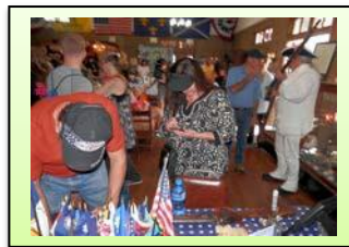
East Fork Trinity #47