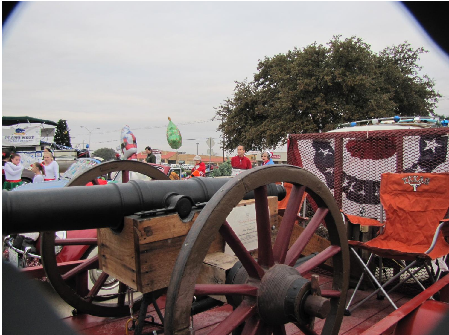
The Plano Parade Cannon, built for the National Congress held in Dallas 2006 It is in a Patriotic Display at the Plano Market Square Mall