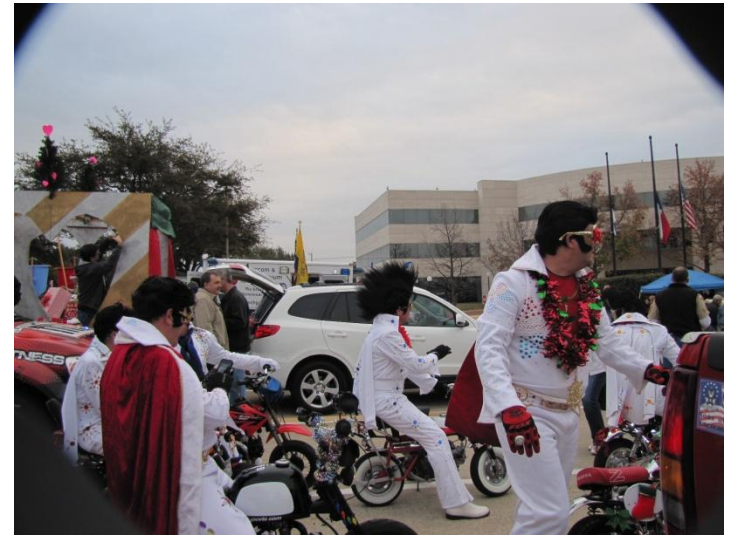
Fortunately we followed the Plano “VW Beetle Club” who were following “Elvis”!