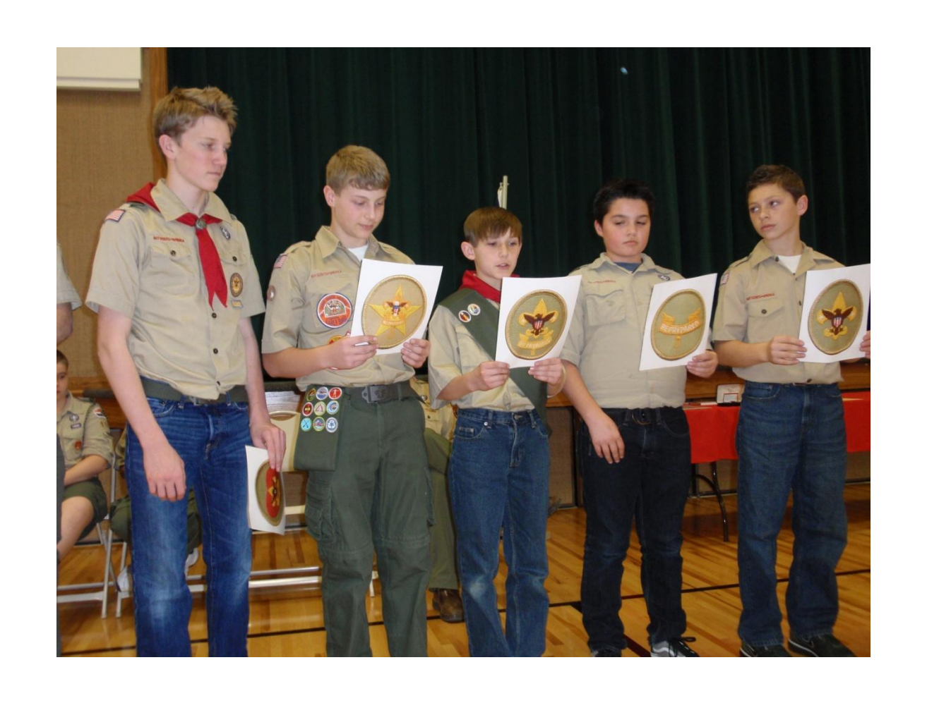
Troop Members Explaining Scout Ranks