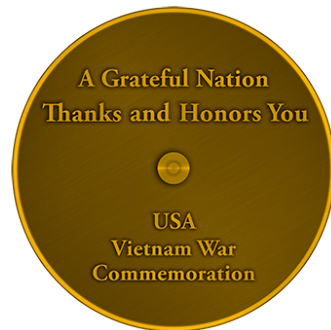
Vietnam Veteran Lapel Pin (Back)