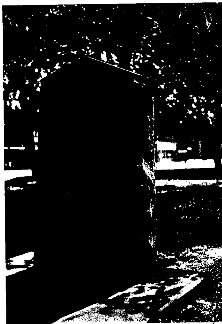
THIS MARKER WAS SET IN 1936 TEXAS CENN.