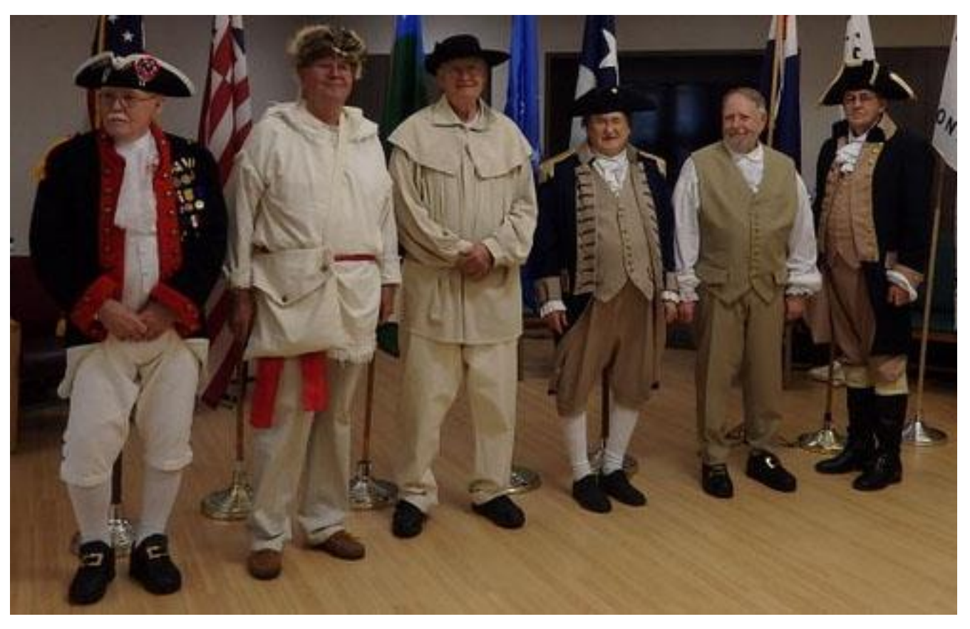
Patriot's Day Celebration VA Hospital, Bonham, TX 04/16/2015