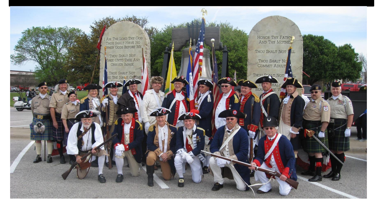
Medal of Honor Parade, Gainesville, Texas 04/11/2015