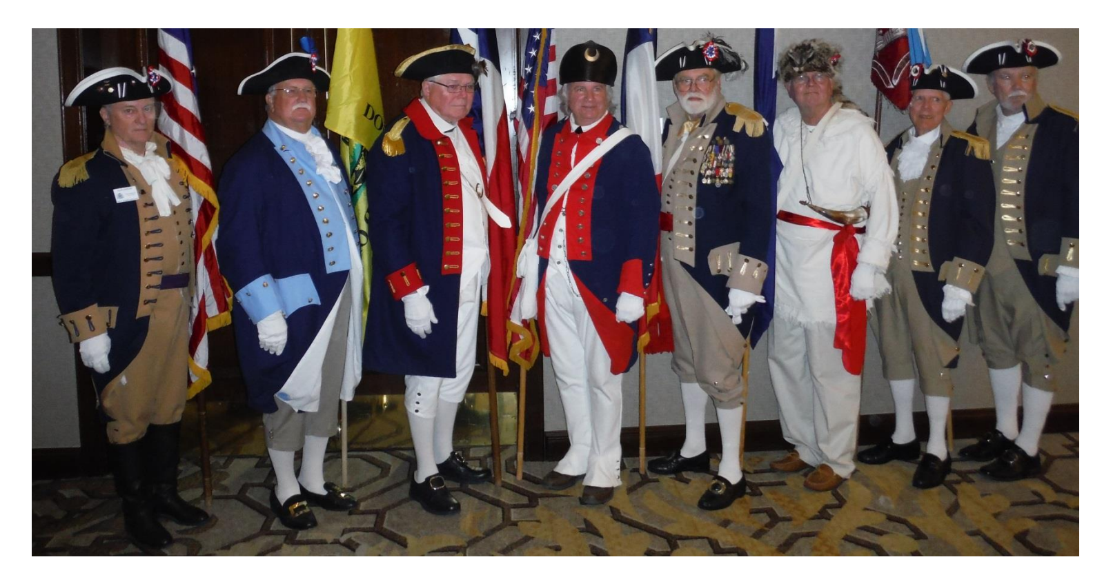
WW II French "Legion of Honor" medal presentation Dallas, TX 04/08/2015