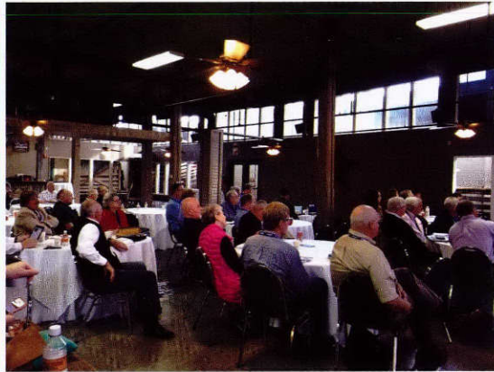
Attendees at the GMDA 2017 Annual Meeting

PGCD participates in GMDA meetings throughout the year, always searching for ways to improve our management processes and communication throughout our District.