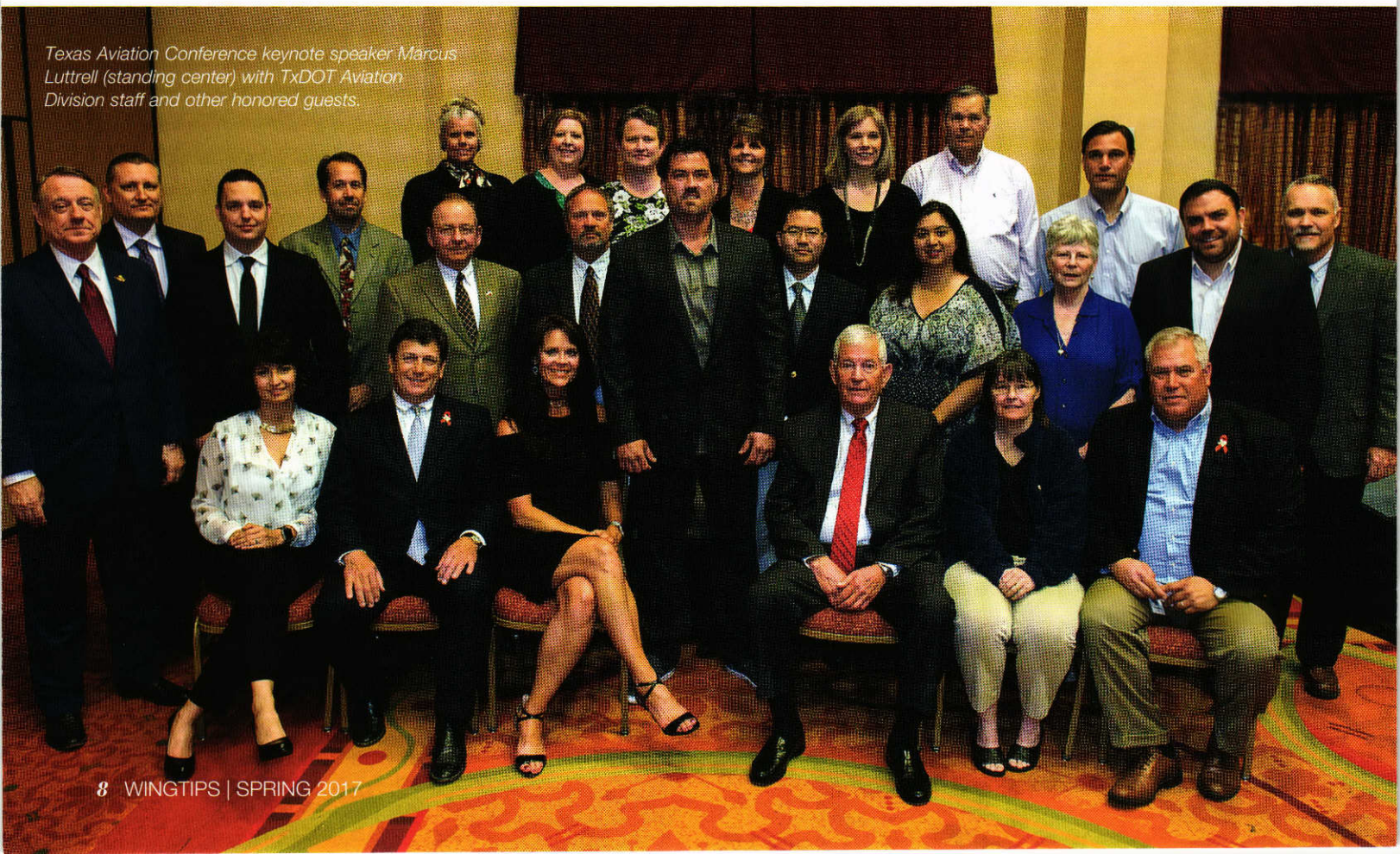
Texas Aviation Conference keynote speaker Marcus Luttrell (standing center) with TxDOT Aviation Division staff and other honored guests.