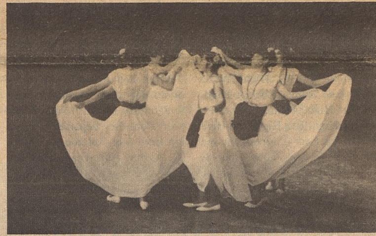
Act of Noche Panamericana.