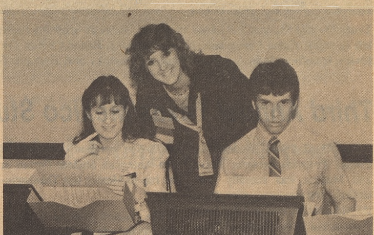
PASF officers counting ballots.