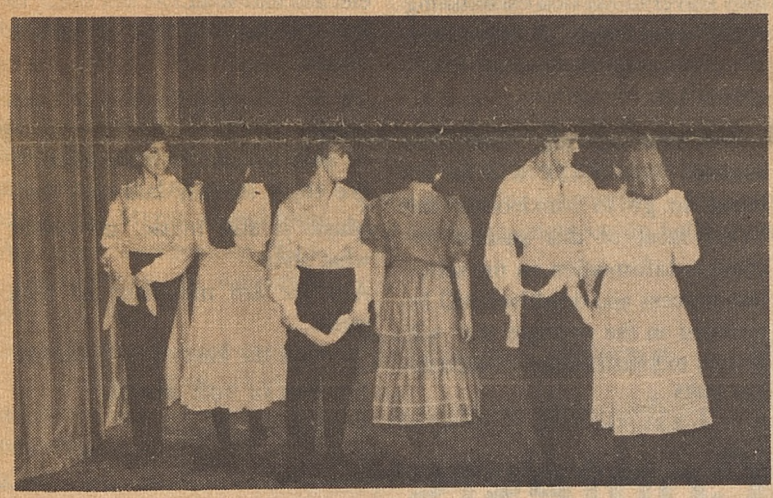
Act of Noche Panamericana.