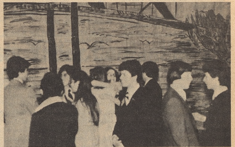
1980 Convention. New and old officers congratulate each other.

A State Officer has many responsibilities concerning Pan American Student Forum. If you are interested in running for an office, consider planning the office for which you best qualify. To begin, you must read Article VII (Duties of Officers) of the state constitution and become fully aware of the duties you must face if elected. Next, the prospective candidate must comply with all the provisions of Article VIII. Finally, the candidates must meet all deadlines.