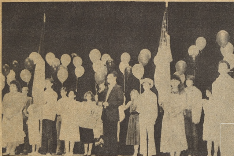
PASF members and Mexican students celebrate the opening of the 1986 Convention through the exchange of flags.