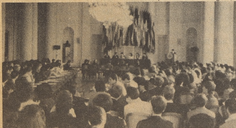
Students at 1985 National Model Organization of American States, Salón de las Américas, Washington, D.C.