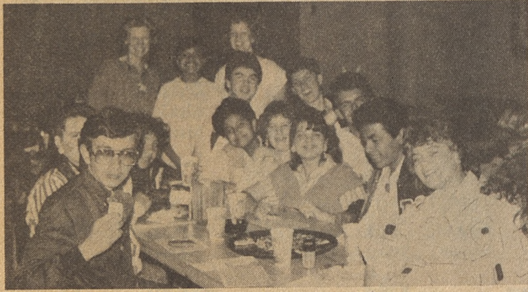
Cy-Fair Hosts Students from Mexico