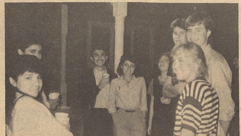
Westlake High School in Austin hosts students from Mexico to a dinner.