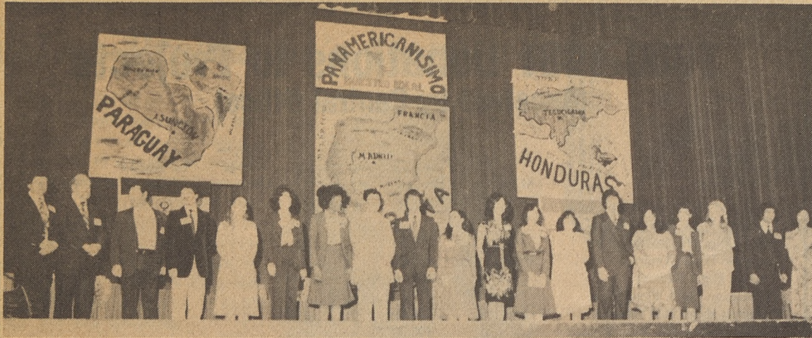
Outgoing and incoming PASF Board members