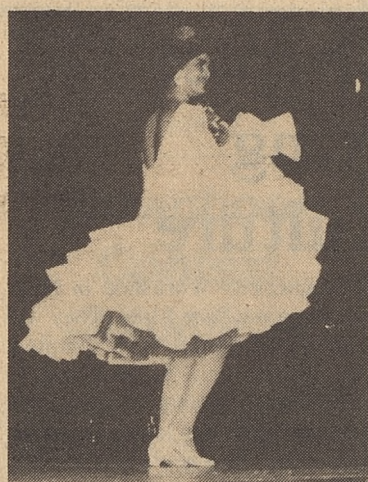
One of the many performances at Noche Panamericana