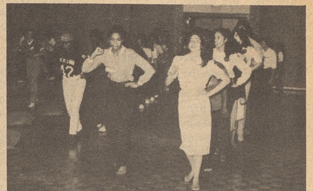
One of the many workshops