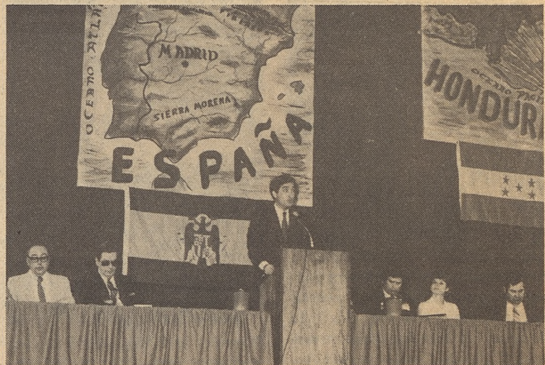
Mayor-elect Henry Cisneros welcomes PASF delegates to San Antonio.