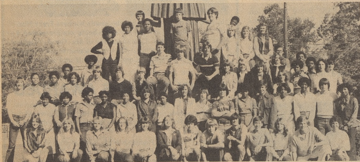
"Los Conquistadores" 1980-81 membership.