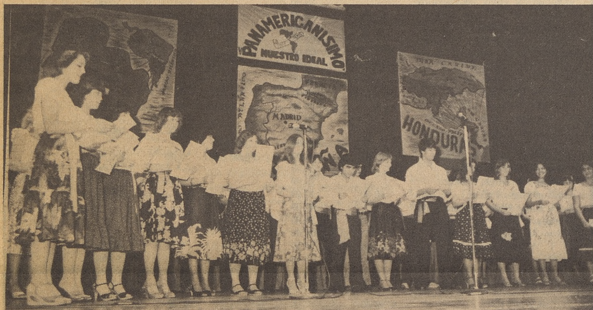
Sing-Song by Waco area schools