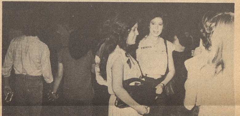
Campaigning by candidates during Mixer