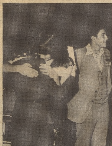
Winners of PASF elections congratulate each other backstage.