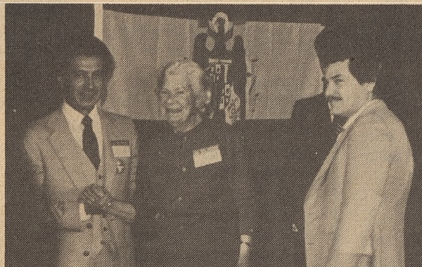
Pesos for Braces representative accepting PASF contributions