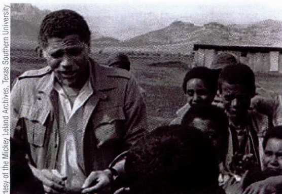
Leland leads a House delegation to Ethiopia on a tour of famine-stricken areas in 1984.