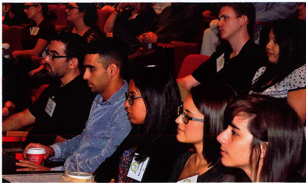
Summer 2016 Mickey Leland interns attend the program's annual conference, "Celebrating 25 Years of Impact and Influence," at the University of Texas' Pickle Research Center on July 14.

For the summer of 2016, 115 interns participated in the program, including 96 placed at the TCEQ and 19 with external sponsors. With more than 550 applicants, the competitive program supplies the TCEQ and