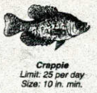
Crappie Limit: 25 per day Size: 10 in. min.