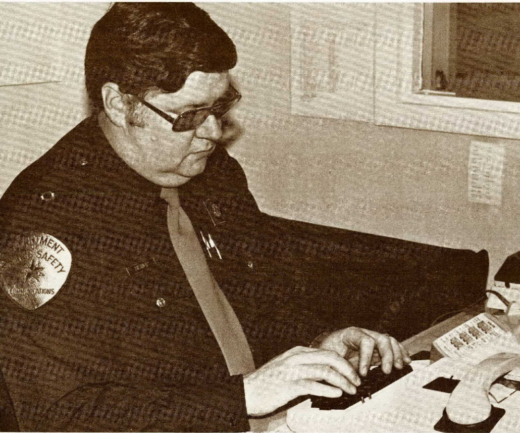
An Austin Department of Public Safety official uses a TDD to communicate with a deaf individual needing emergency help.

Are you a deaf or hearing impaired individual who needs emergency help?