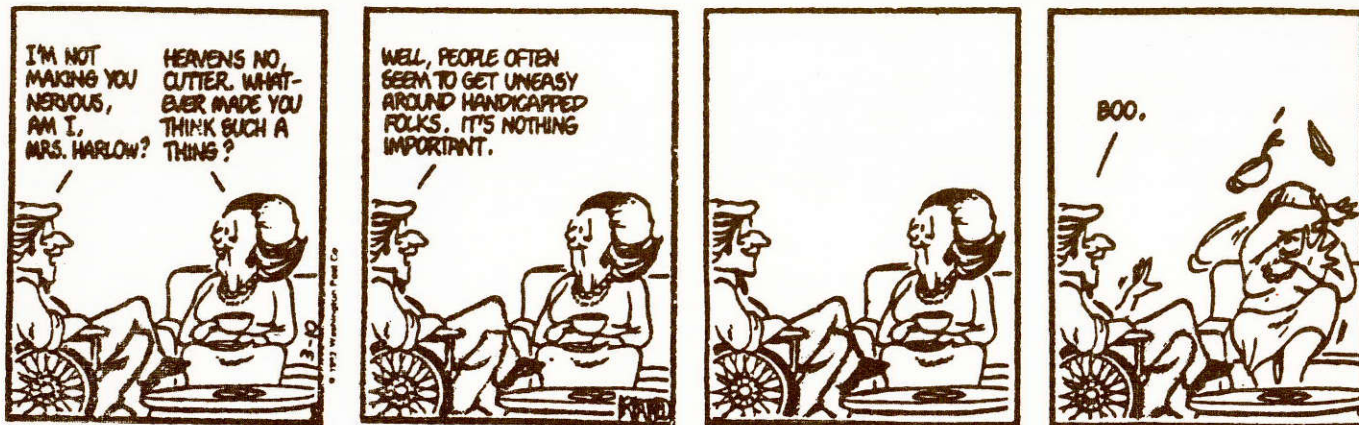
By Berke Breathed, U. S. syndicated cartoonist, known for his use of a person with a disability as one of several different characters. As shown here, he humorously presents the awkwardness of non-disabled persons towards people who are disabled. Information excerpted from United Nations publication, "Improving Communications About People with Disabilities".