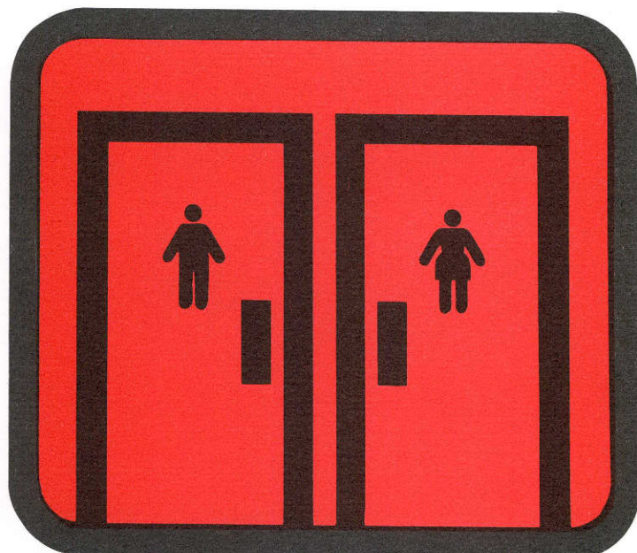
Or In Restrooms

AIDS doesn't spread through casual contact. Don't let fear get in the way of facts. Take the time to learn about AIDS.