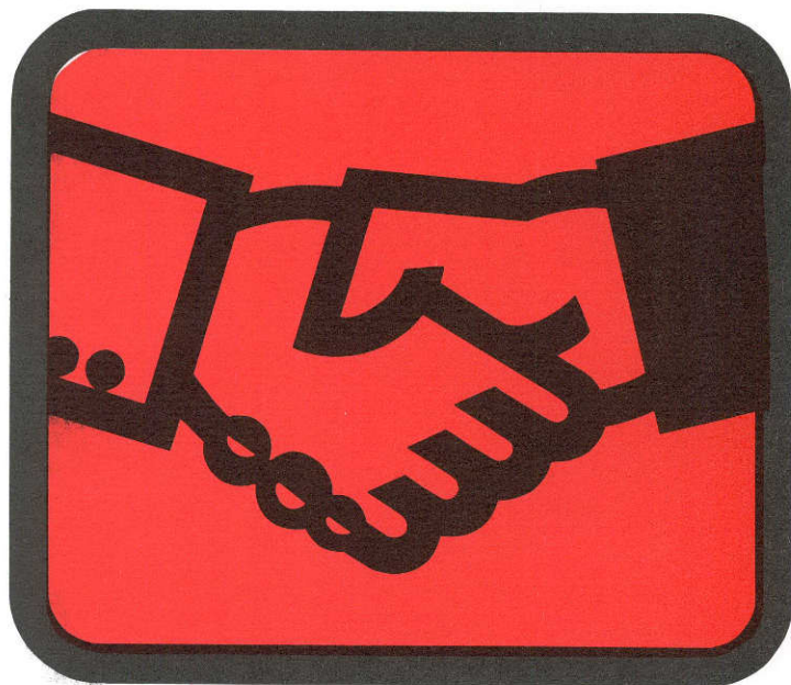
By Shaking Hands