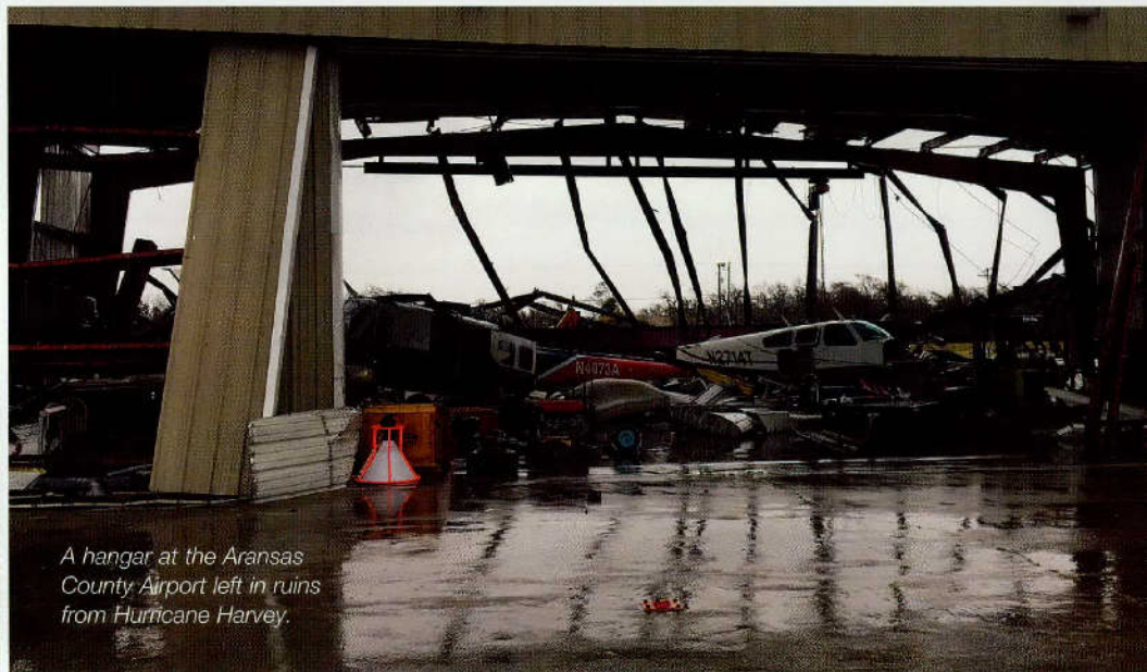
A hangar at the Aransas County Airport left in ruins from Hurricane Harvey.

The hurricane lasted all night. When it was over, Geer went outside to assess the damage.