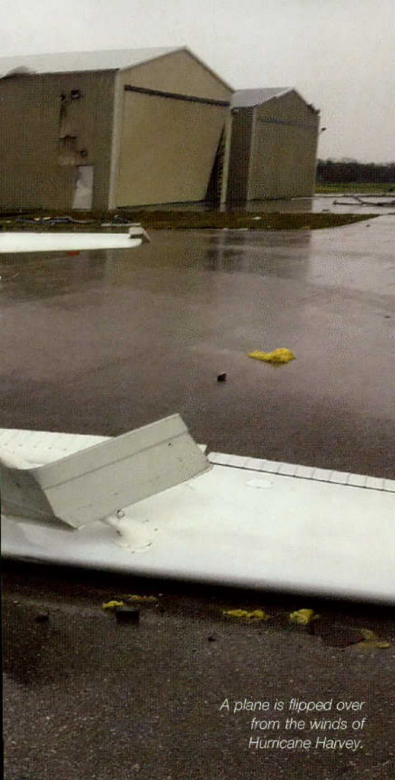
A plane is flipped over from the winds of Hurricane Harvey.