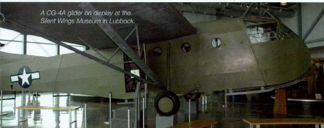
A CG-4A glider on display at the Silent Wings Museum in Lubbock.

Copies of this publication have been deposited with the Texas State Library in compliance with the state Depository Law.