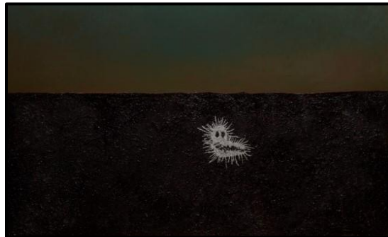
Earl Staley Landscape With Skull 1974. Museum of Fine Arts Houston