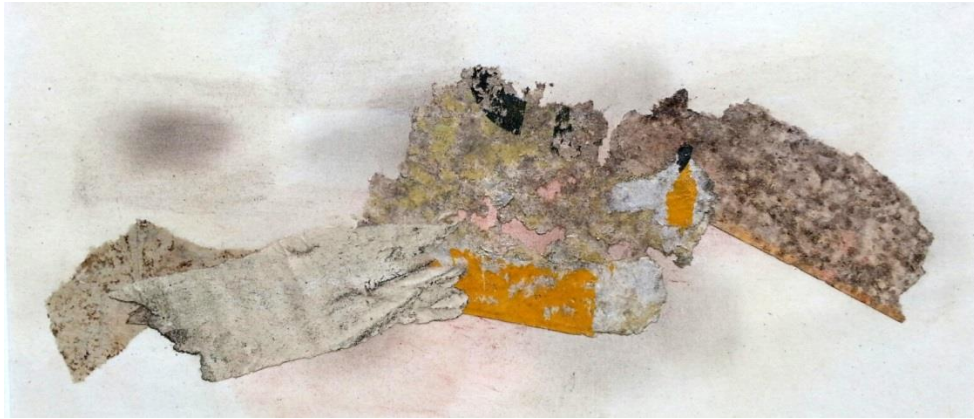
Gene Charlton [Untitled collage] 1959