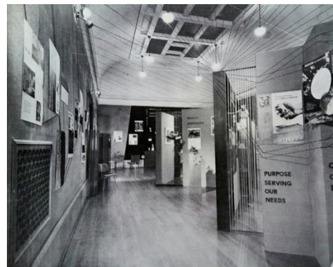
This Was Contemporary Art installation views, 1948