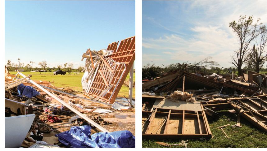
damaged and later demolished based on the guidance of a structural engineer. The Texas Legislature appropriated $2.55 million to rebuild the visitors center; the work will be underway soon. The grass house, built by Caddo tribe members and volunteers in 2016, was also destroyed. A July

One survivor recalled the trauma of protecting a child he initially thought was his own; after shielding the young girl while being pummeled with debris, he located his