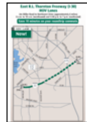
View the extension of the I-30 East (East R.L. Thornton) HOV lane map