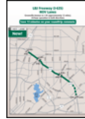
View the I-635 (LBJ Freeway) HOV lane map