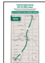
View the US 75 HOV lane map