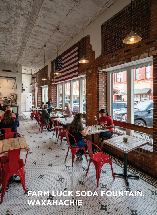
FARM LUCK SODA FOUNTAIN, WAXAHACHIE

is awe-inspiring. Be sure to step inside to see the ornate woodwork, intricate detailing, and bathroom converted from a former vault.