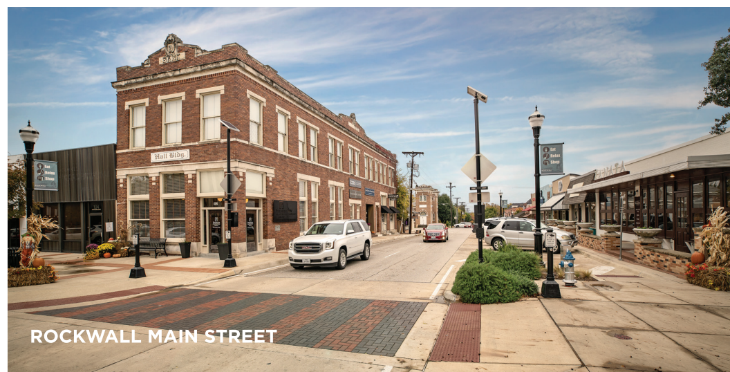
ROCKWALL MAIN STREET

To learn more about the Texas Main Street Program, visit thc.texas.gov/tmsp . For more information about the Main Street Now conference, go to mainstreet.org .