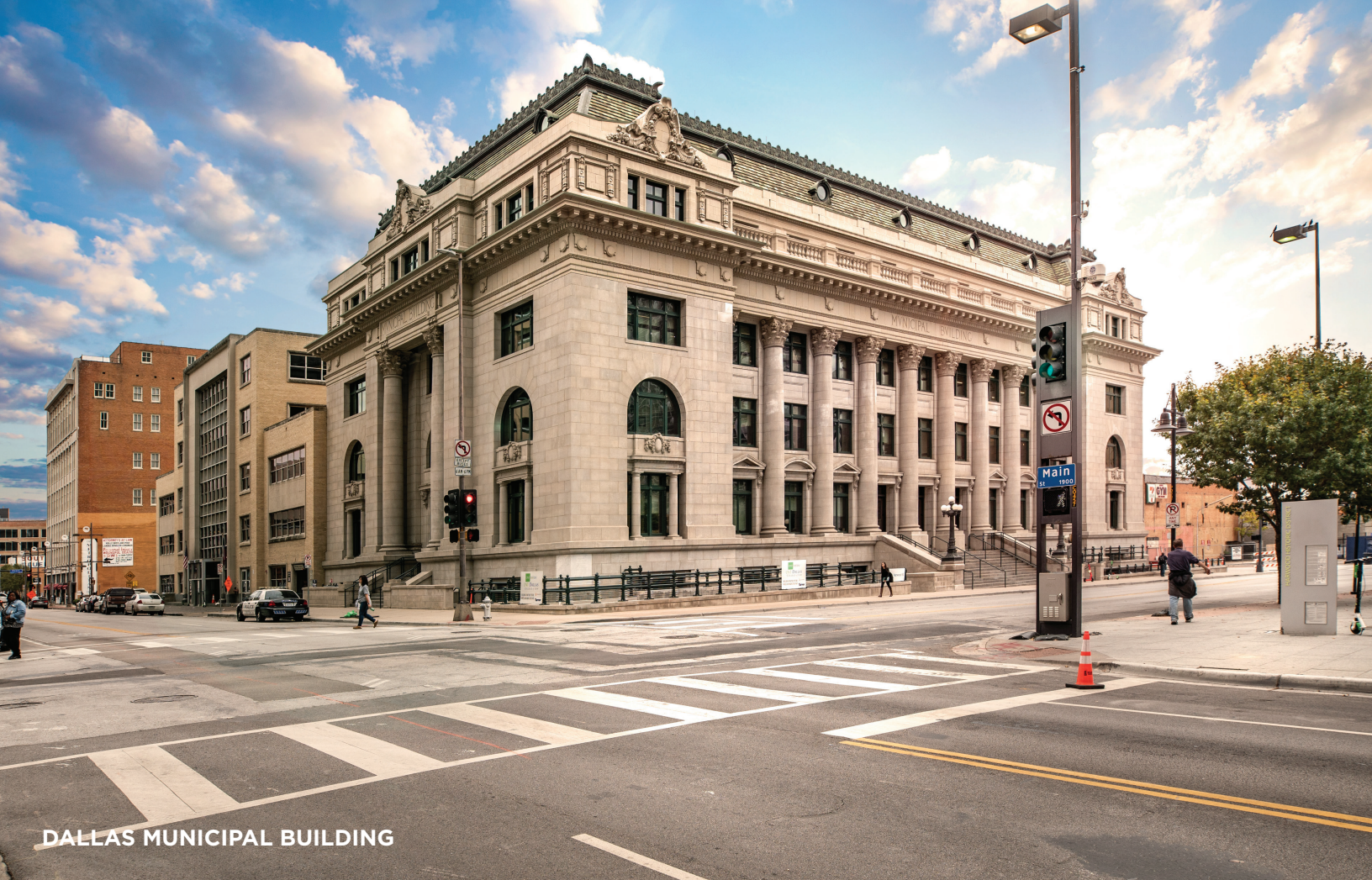
DALLAS MUNICIPAL BUILDING