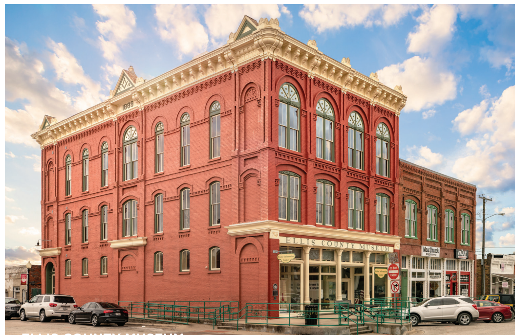
ELLIS COUNTY MUSEUM, WAXAHACHIE

The 1897 Ellis County Courthouse (co.ellis.tx.us, 972-825-5000), restored through the THCPP, is certainly deserving of its acclaim. The nine-story, pink granite and red sandstone structure, designed in the Romanesque Revival style, is a true sight to behold—ornate nooks and crannies give way to massive architectural design features, and the entire castle-like element of the edifice