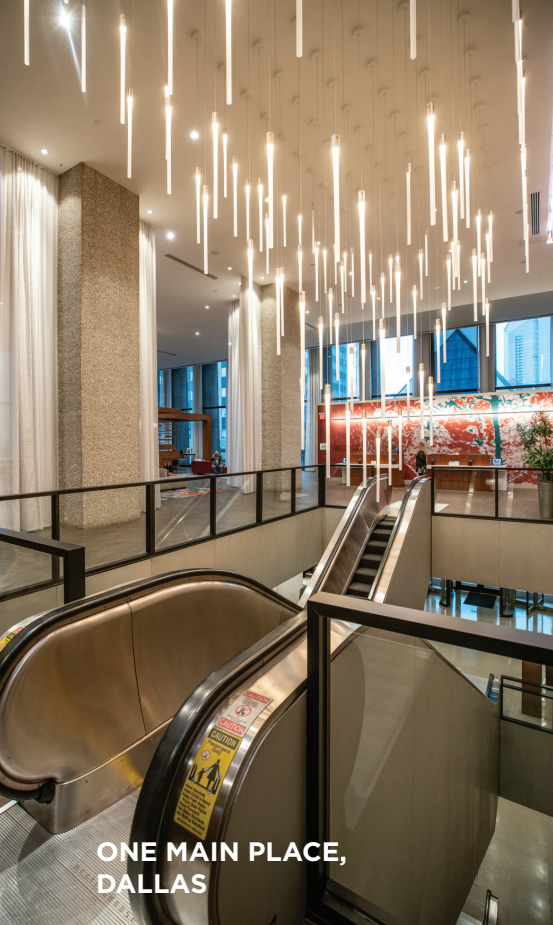
ONE MAIN PLACE, DALLAS

Just down the block is the Busch-Kirby Building , a THC Recorded Texas Historic Landmark. Constructed in 1913 for beer magnate Adolphus Busch as a complementary facility for his Adolphus Hotel, the 17-story skyscraper features Gothic pinnacles and spires. The Adolphus (adolphus.com, 214-742-8200), a block south of Main Street, is a 1912 architectural gem featuring faces carved on the stone exterior and an opulent lobby area with elaborate French Renaissance detailing.