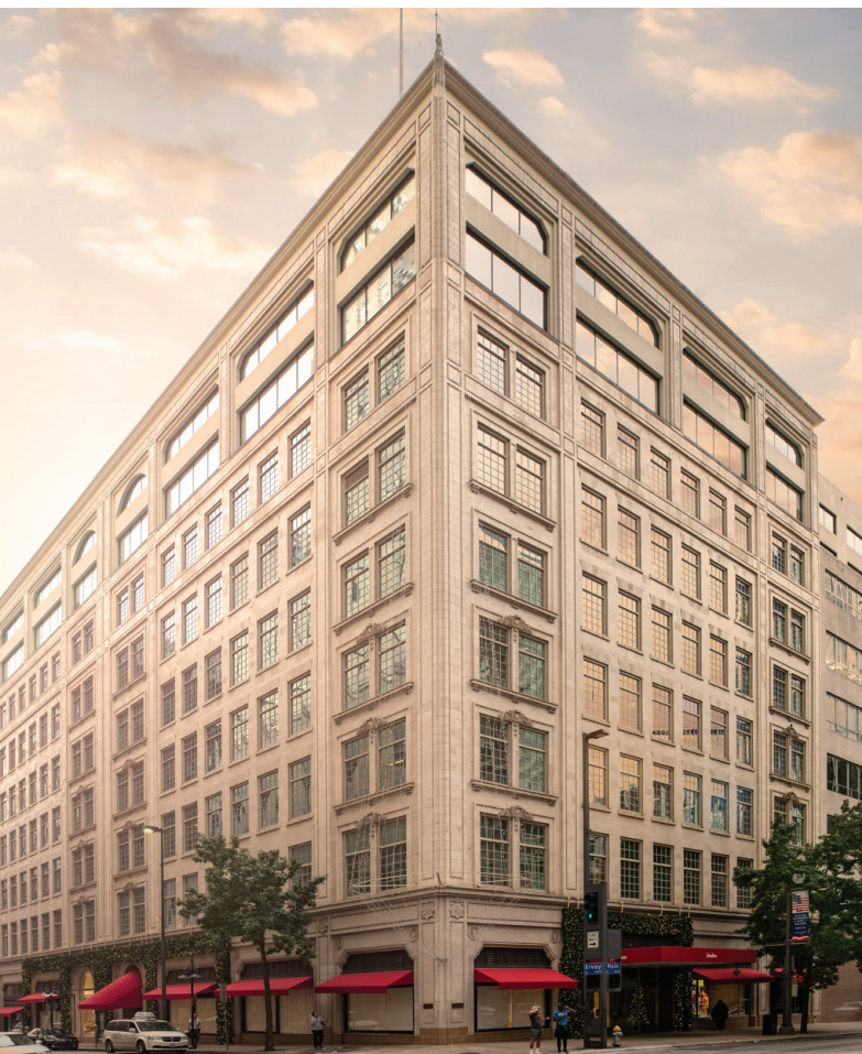
ORIGINAL NEIMAN MARCUS BUILDING