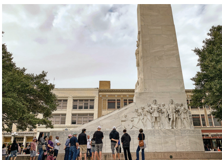
1936 “Spirit of Sacrifice” cenotaph.

The THC approves any work permit pertaining to State Antiquities Landmarks, which the Alamo was designated as in 1983. As part of the Alamo Master Plan project, the THC has worked closely with the City of San Antonio, the Texas General Land Office, and the Alamo Trust since 2016. The THC has granted several Phase One permits involving sensitive archeological and other work done impacting the Long Barracks, church, and Alamo Plaza.