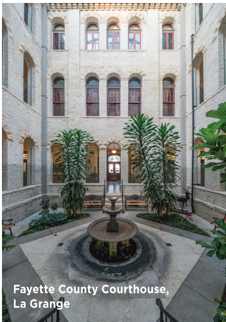
Fayette County Courthouse, La Grange