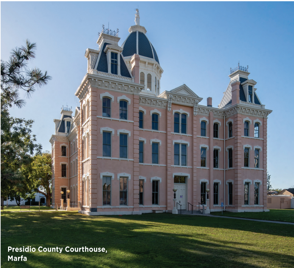
Presidio County Courthouse, Marfa

Kimble, Washington, Willacy, and Wise counties received planning grants to be applied toward the production of construction documents for a future application to the THCPP for full restoration of their courthouses. Duval and Lee counties received emergency grants to address critical issues, including the replacement of an original electrical system and foundation repairs.