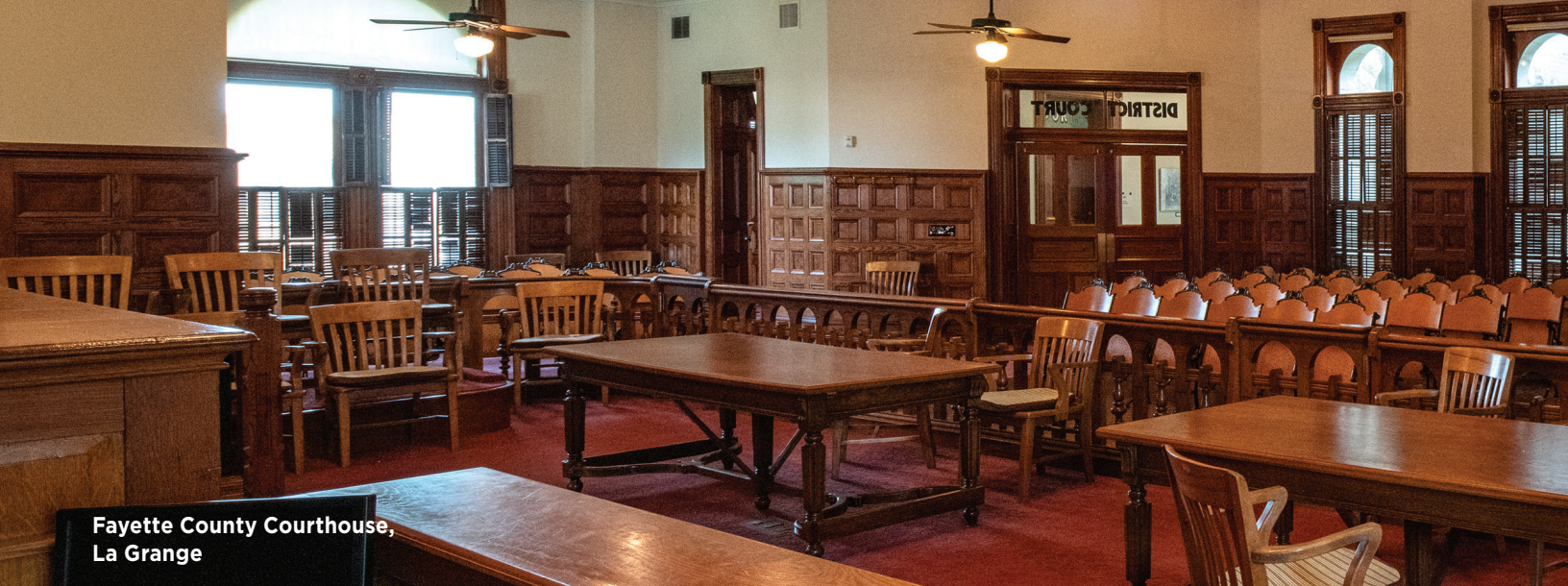
Fayette County Courthouse, La Grange

As part of the stewardship program, THC reviewers help counties by offering professional advice on how to best preserve the buildings. Useful information is also available at thc.texas.gov/tcsp , where county staff can access the Courthouse Maintenance Handbook and other resources on courthouse components and systems. These reference materials are valuable tools, allowing county staff to plan for