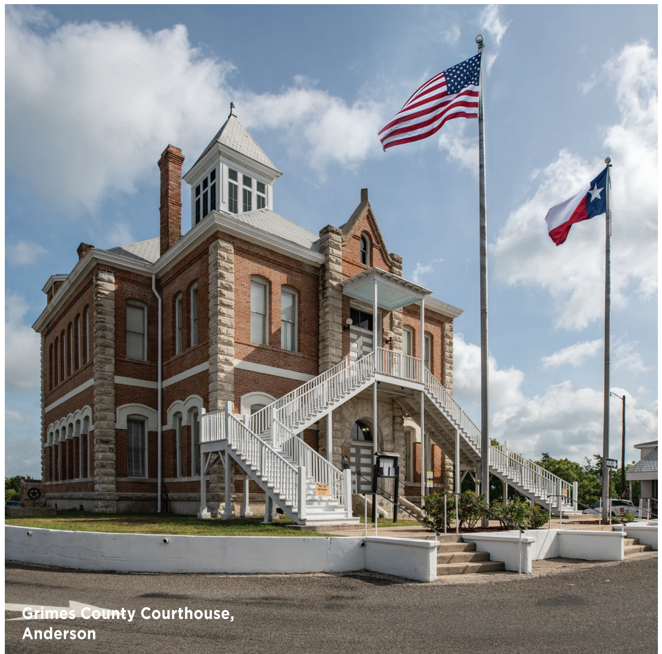
Grimes County Courthouse, Anderson

The THC received applications from 21 counties requesting over $100 million