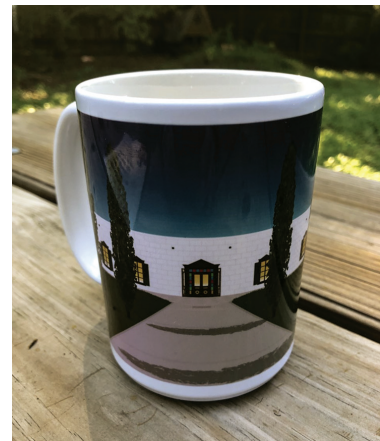
Magoffin Home State Historic Site mug.

Sip hot chocolate in style this holiday season with wraparound mugs—each uniquely designed with artistic renderings of its corresponding state historic site. The mugs are available at the following sites: Caddo Mounds, Confederate Reunion Grounds, Eisenhower Birthplace, Fort McKavett, Fort Griffin, Fort Lancaster, Fulton Mansion, Landmark Inn, Mission Dolores, Magoffin Home, Sam Bell Maxey House, Sam Rayburn House, San Felipe de Austin, and Varner-Hogg Plantation.