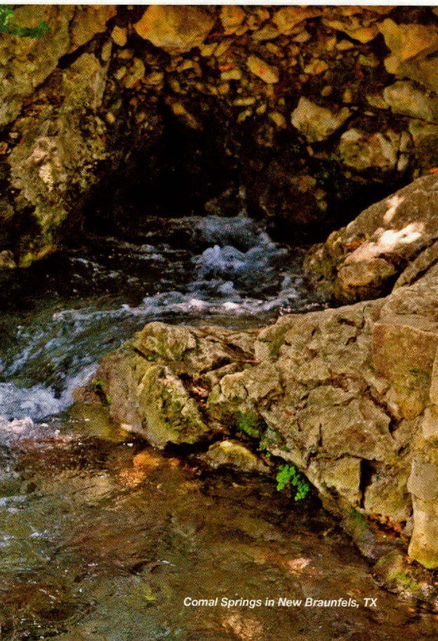
Comal Springs in New Braunfels, TX

of requirements given in §26.405(2) of the Texas Water Code. Organizations, the report as a whole is the work of the TGPC and participating organization. The effort was partially funded by the U.S.