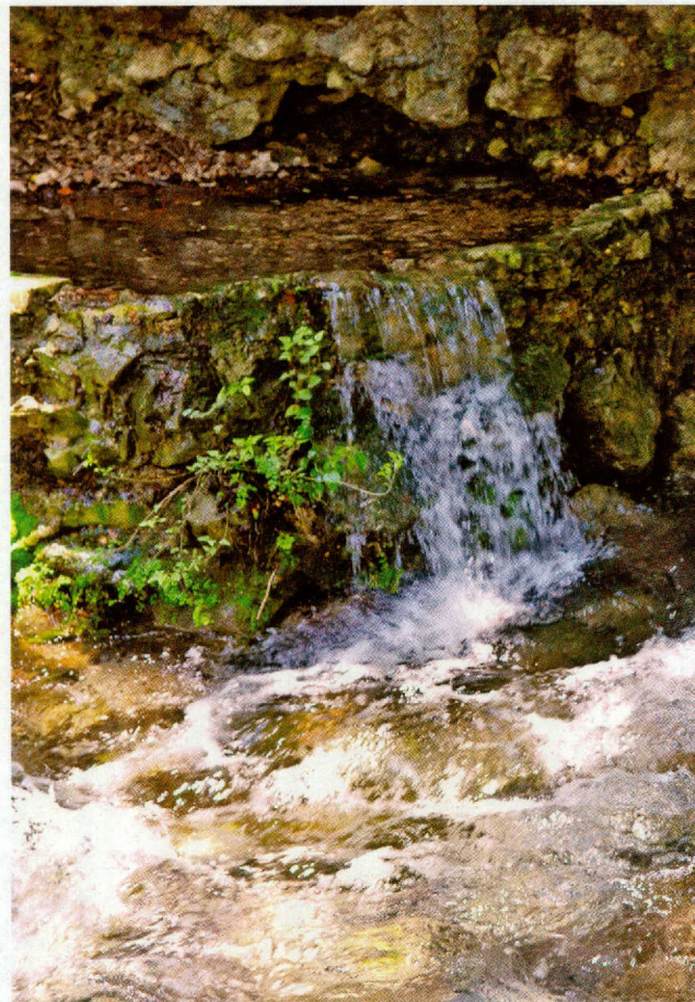
This document was developed and produced by the TGPC in f... While the report represents the contribution of individual particip... does not necessarily reflect all of the views and policies of each... Environmental Protection Agency.

The plan for preserving groundwater in the state starts with the existing regulatory and non-regulatory groundwater protection, remediation, and conservation programs listed in the Joint Report . In addition, this edition of the Strategy document introduces a summary of the dynamic and interactive processes by which information is exchanged and recommendations are made within and between the TGPC, its Subcommittees, and the public in order to further protect groundwater resources in the state. The comprehensive strategy for protecting groundwater in Texas includes both the TGPC member’s internal programs and the TGPC’s internal processes outlined below.