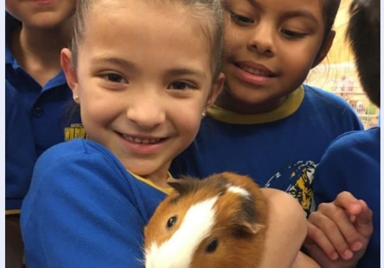
Students from the Blue Ribbon-winning Wilbur E. Lucas Elementary School: “Learners Today, Leaders Tomorrow.”