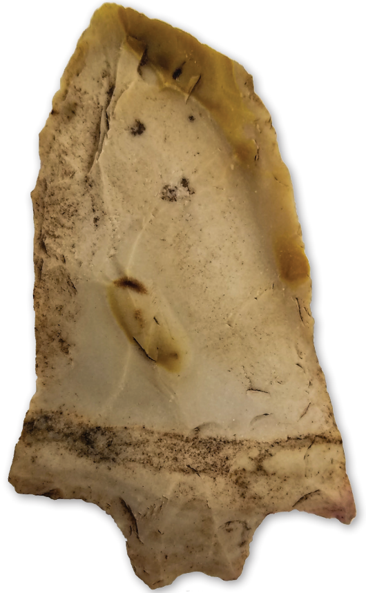
TOP: Native stone point fragments and preforms. Numerous specimens have been excavated from the area surrounding the French Legation and provide evidence for the long occupation of the land where the French Legation now stands.