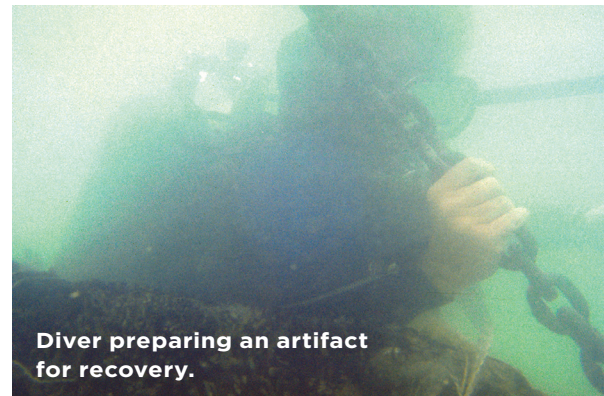
Diver preparing an artifact for recovery.

Until Connor's 1964 discovery, the shipwrecks were largely an element