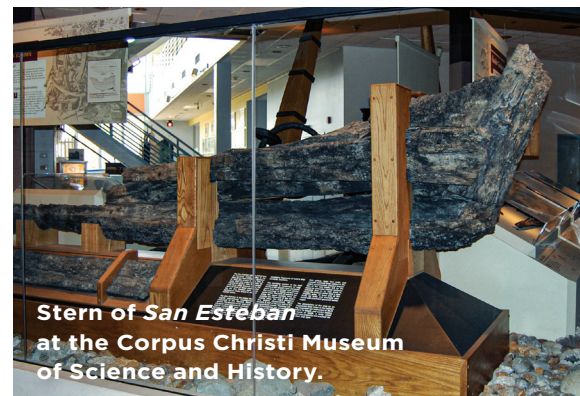
Stern of San Esteban at the Corpus Christi Museum of Science and History.