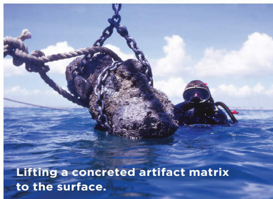
Lifting a concreted artifact matrix to the surface.

BEACHCOMBING: thc.texas.gov/BeachArtifact