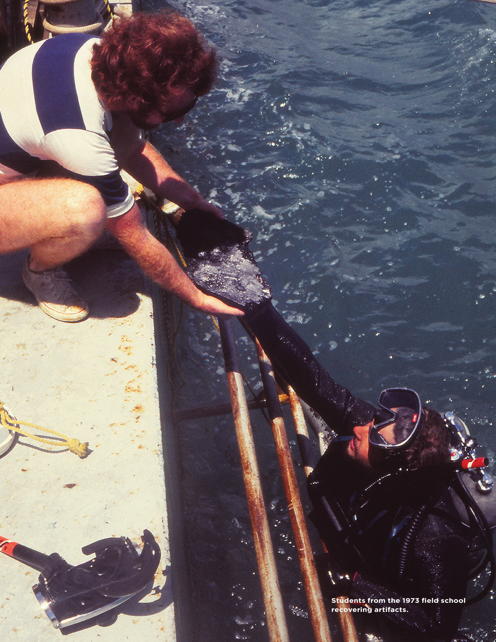
Students from the 1973 field school recovering artifacts.