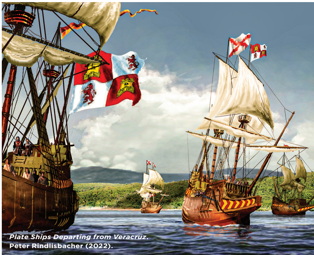
Plate Ships Departing from Veracruz. Peter Rindlisbacher (2022).

The vessels were part of an original fleet of 54 that departed Spain in July 1552 for Cartagena (in modern-day Colombia) and Veracruz (modern Mexico). These ships were part of a convoy system tasked with transporting colonial supplies and raw materials—such as silver, gold, and cochineal—between Spain and its territories.