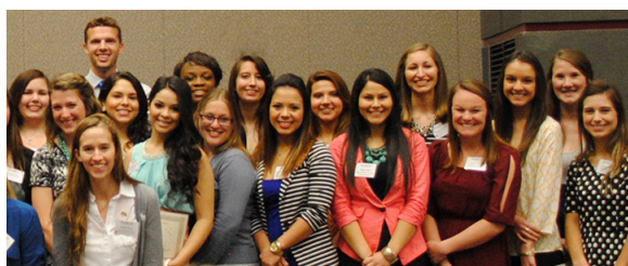
Students receiving scholarships, including the Patricia Fertsch Beck Education Scholarship.