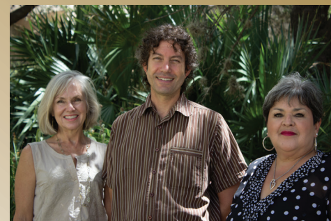
Project SUPERB | CLAS

"God gave me this gift of using recreation to help persons with disabilities. When I was young, my best friend had Down Syndrome and I taught her to roller skate and jump rope. I was a recreation therapist in the making from way back. To this day I still take my students to all kinds of adaptive recreation events outside the classroom so that they can realize their gifts too."