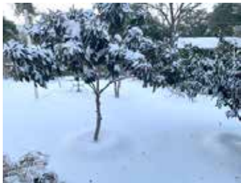
Winter storm pictures one of our member's small orchard covered in white blanket of snow.

SAVE THE DATE: The Windcrest Civic Center has been reserved, and WGC scheduled an in-person meeting April 5, 2021. Guest welcomed! Installation Luncheon scheduled May 3rd.