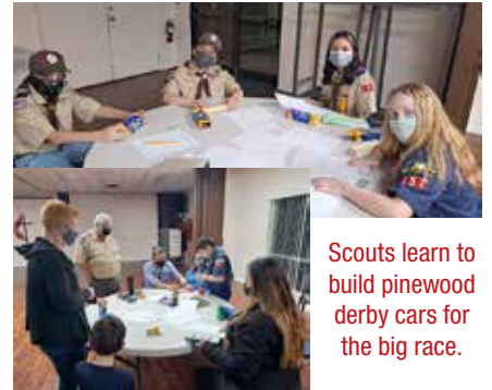
Scouts learn to build pinewood derby cars for the big race.