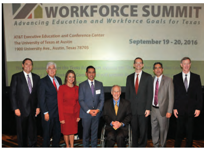
September 19, 2016 – Statewide leaders joined Governor Greg Abbott's Tri-Agency Education & Workforce Summit.

We also created a Skills for Transition training program that will work with service members who are within 180 days of separation from service, and who plan to remain in Texas. Finally, on September 28th, we partnered with the Office of the Governor, the Governor's Commission for Women, and the Alamo Area Council of Governments to host the Inaugural Governor's Business Forum for Women in San Antonio in support of Governor Greg Abbott's goal to make Texas #1 for women-owned businesses. The sold-out event provided women-owned businesses