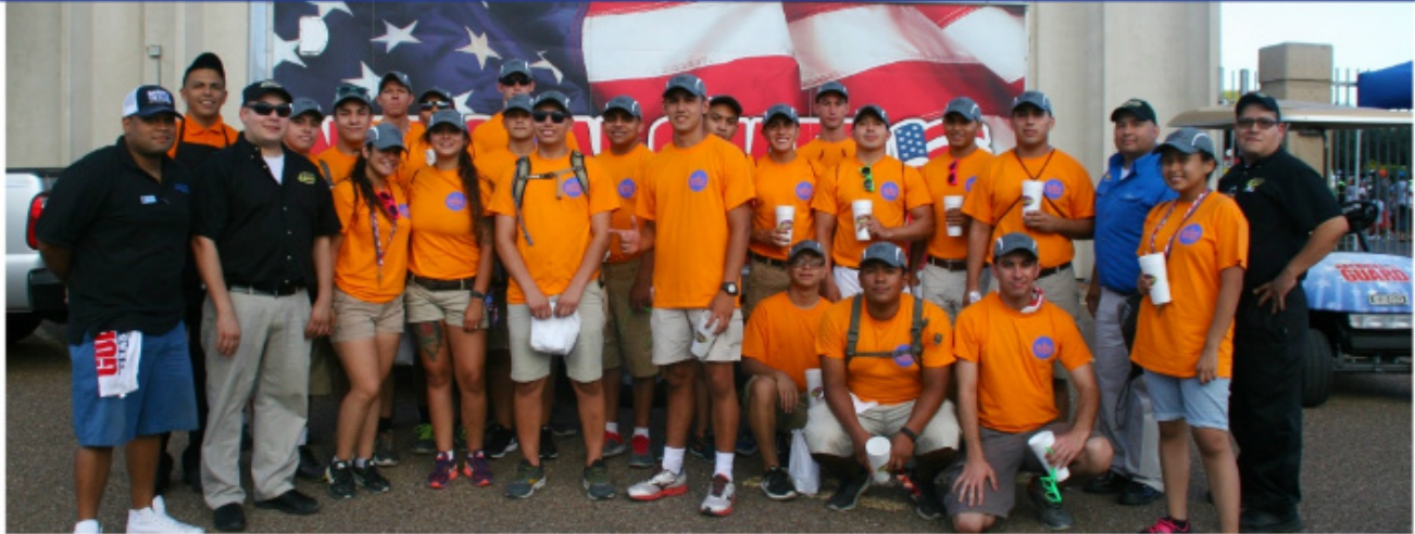
RSP Warriors take a break from support duties to enjoy a meal provided by Taqueria El Zarape