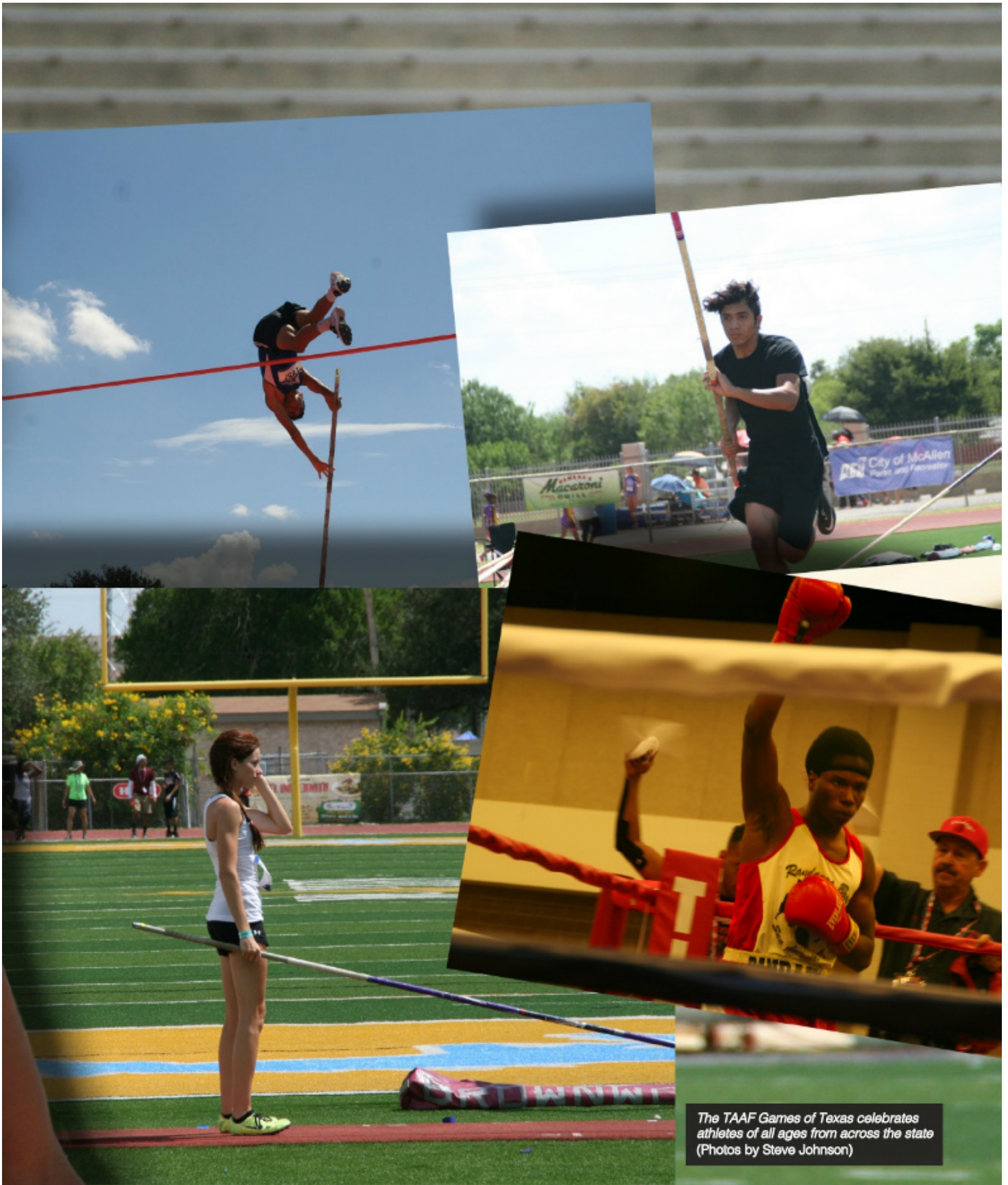
The TAAF Games of Texas celebrates athletes of all ages from across the state