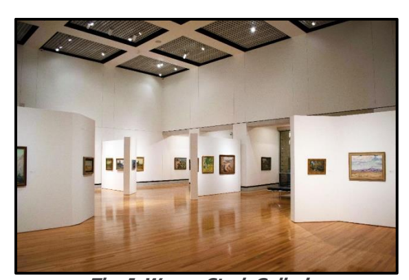
The J. Wayne Stark Galleries