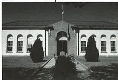
Shown right: Hudspeth County Courthouse Below right: Hood County Courthouse