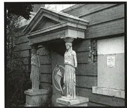
These caryatids at the 1914 Nueces County Courthouse have been neglected for more than 20 years. Because of a deed restriction held by the THC, the building is still standing and has received Round II funding.