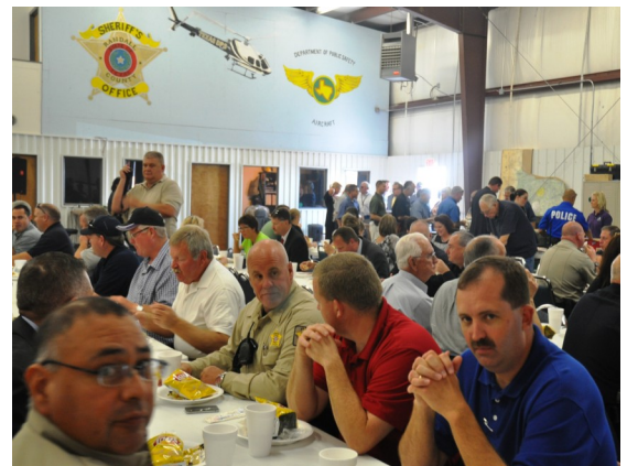
The community enjoys lunch at the Texas Peace Officers' Memorial Fundraiser in the DPS Hangar in Amarillo, TX