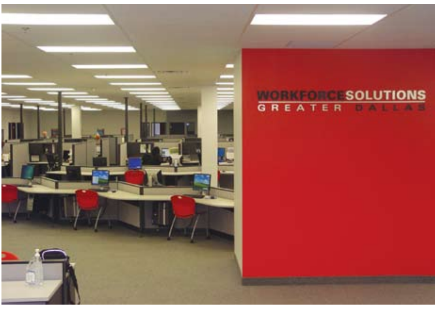
The new Workforce Solutions Greater Dallas workforce center features 52 work stations, two computer labs, four classrooms, and a 1,000-square-foot meeting space.

The grant, funded through the American Recovery and Reinvestment Act of 2009, added dependent care and transportation assistance to job-search services for dislocated workers who qualify for Trade Adjustment Assistance, which