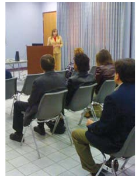
Participants attend a diversity training program at the Paris workforce center location.

to benefit their current workforce. Funding for the training development is provided by PEDO