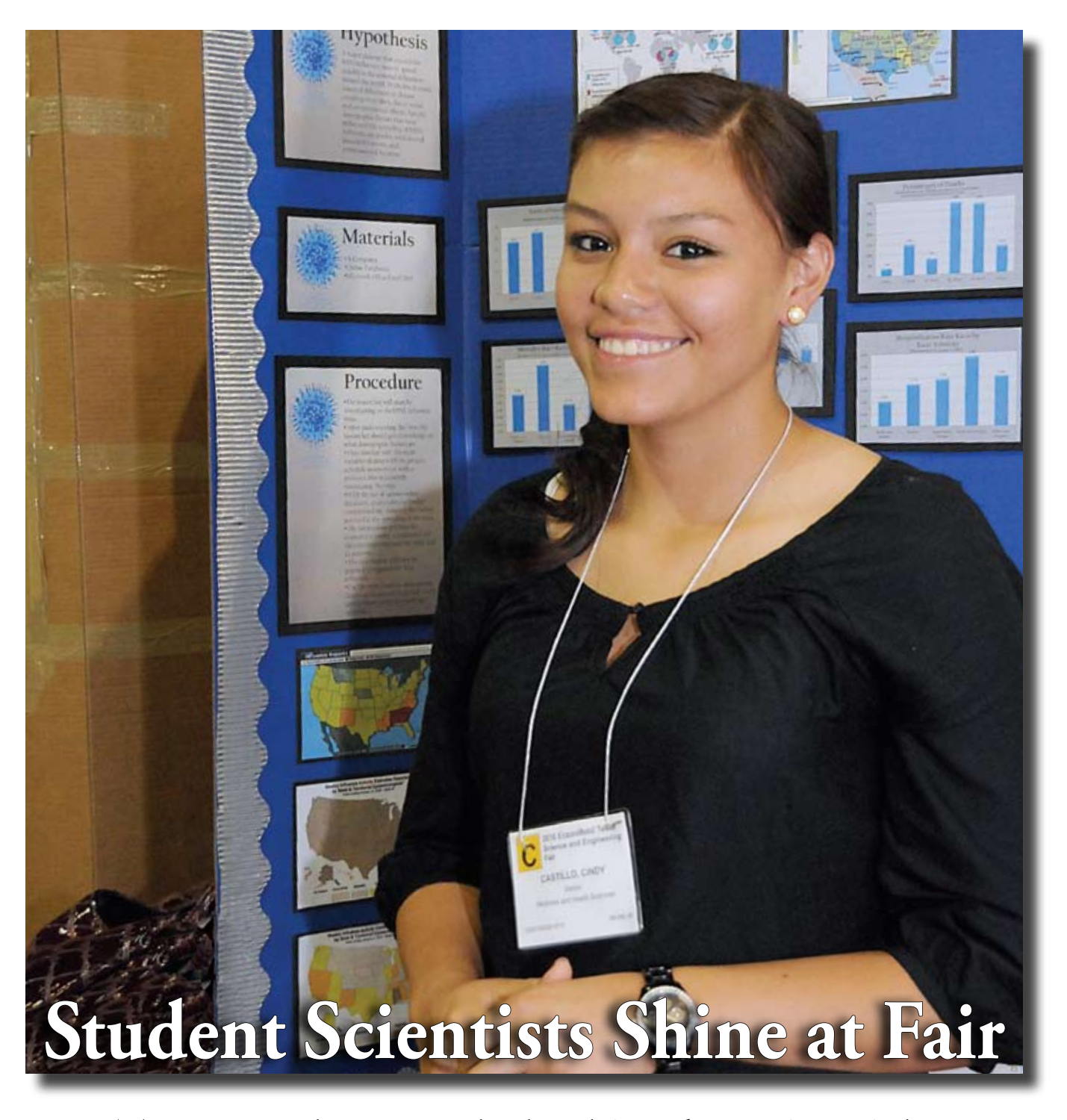
Texas youth earn scholarships, bragging rights at statewide competition