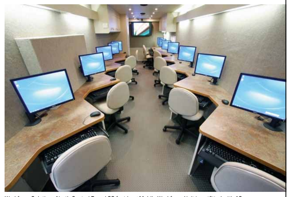
Workforce Solutions North Central Texas' 38-foot-long Mobile Workforce Unit is outfitted with 13 computer stations plus a top notch video system that allows staff to give presentations to groups.

Murtagh. "The mobile unit enables us to go to the people we serve."