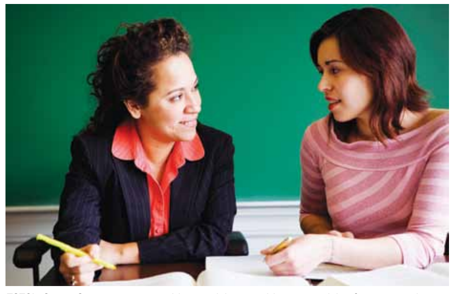
TSTC's Smart Start program provides participants with career advice from counselors and faculty members to help ensure students are in the right area of study for their interests. Participants also may participate in workshops and one-on-one tutoring.