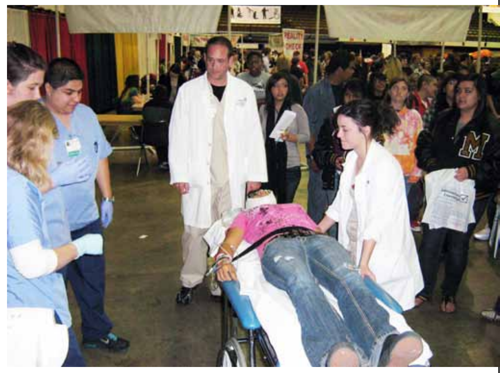
One of the highlights of the South Plains Career Expo was a mock hospital set up by the Covenant School of Nursing, which allowed students to observe life inside an emergency room.

Popular booths included a 'Crime Scene Investigation' setup where students witnessed a 'live' crime scene while the Lubbock County Medical Examiner's Office and South Plains