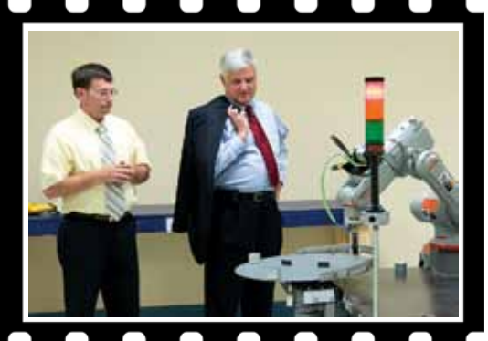
(4) Vernon College students receive hands-on training. (5) TWC Commissioner Ronny Congleton presents a Skills grant check to Lamar Institute of Technology and a consortium of health care providers. (6) TWC Chairman Tom Pauken tours Vernon College facilities following Skills grant check presentation.