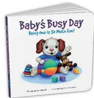
A children's book from the Learn the Signs. Act Early. program called Baby's Busy Day: Being One is So Much Fun!

The Texas Health and Human Services Commission (HHSC) Early Childhood Intervention (ECI) program works with families with children birth to 36 months old, with developmental delays, disabilities, or certain medical diagnoses that may impact development. ECI services support families as