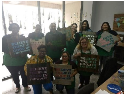
Unit Team Building