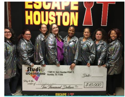
Admin Asst Day