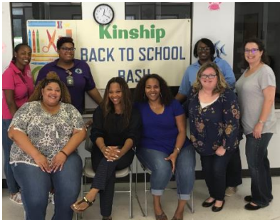
Back to School Bash