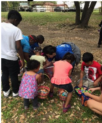
Easter Egg Roll