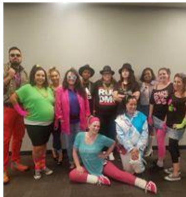
80's Unit Mtg