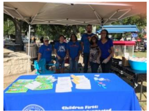
1 st Annual GPG Picnic