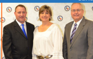
Highland School Highland ISD