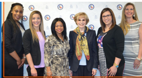
Kimberlin Academy for Excellence Garland ISD