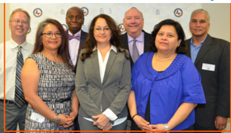
Blackshear Elementary School Austin ISD