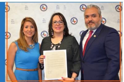
Olmito Elementary School Los Fresnos ISD