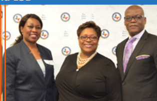
N. Houston Early College HS Houston ISD