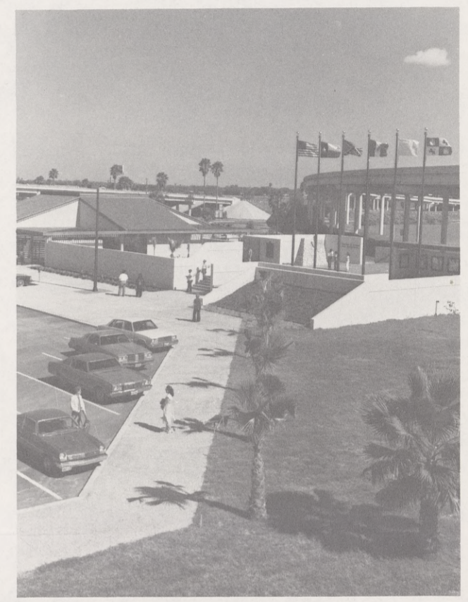
TEXAS TOURIST BUREAUS