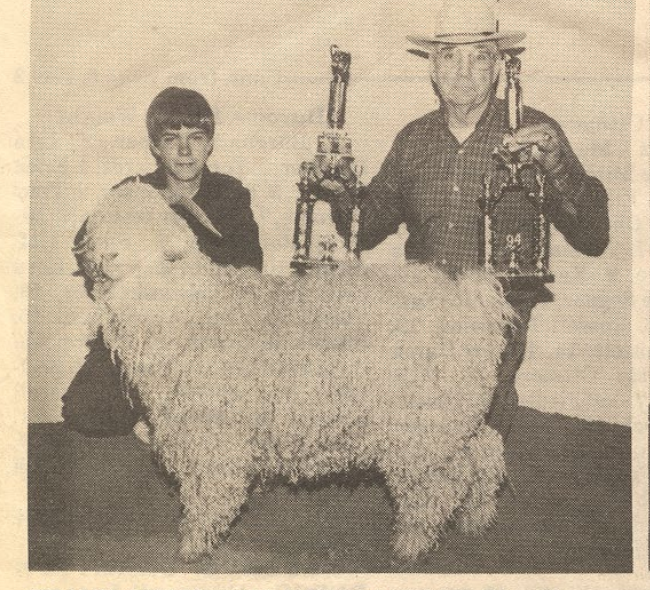
10 FREDERICKSBURG STANDARD-RADIO POST, WED., JANUARY 19, 1994