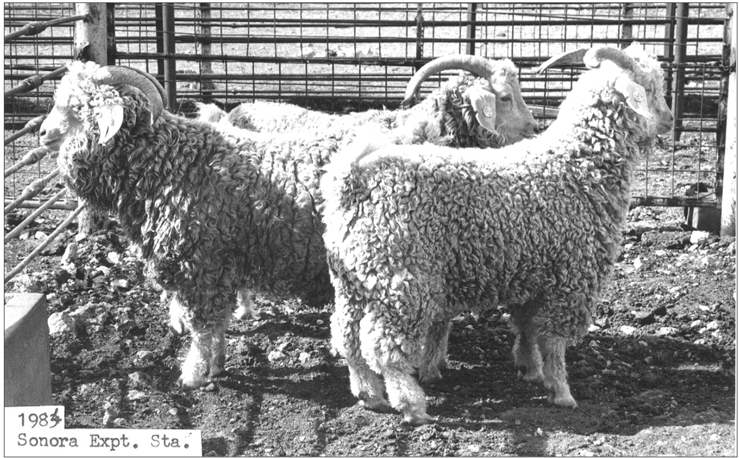
1984 - A group of angora billies shown here at the Sonora Experimental Station where Jack Groff organized an Angora Industry Performance Test which still being used today at the Station.

C:\My Documents\Pictures – Word Format File: Groff, Jack – Angora Test Billies