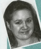
Botessa Love Perryton Wild Wild Winnings $1,000