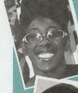
Ykita Reese Bellville Pick 3 $660