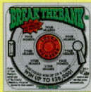
Game #266 ($2) Break The Bank *Overall Odds are 1 in 4.94.