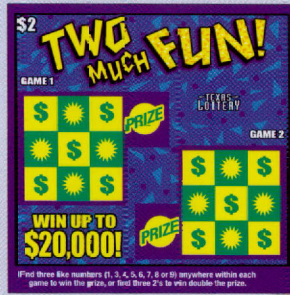
#255 Two Much Fun! ($2) Top Prize: $20,000