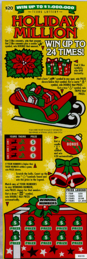
#336 Holiday Million ($20) Top Prize: $1,000,000