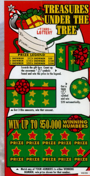
#316 Treasures Under The Tree ($5) Top Prize: $50,000