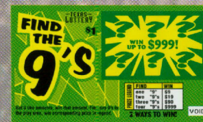
#359 Find The 9's ($1) Top Prize: $999

NOTICE: A Scratch Off game may continue to be sold even when all the top prizes have been claimed. For current information on prizes remaining in a Scratch Off game, call 1-800-37-LOTTO.