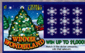
#358 Winner Wonderland ($1) Top Prize: $1,000