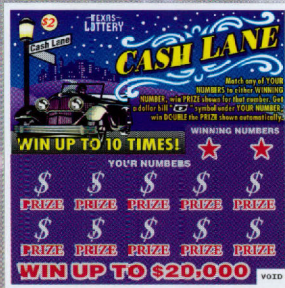
#294 Cash Lane ($2) Top Prize: $20,000