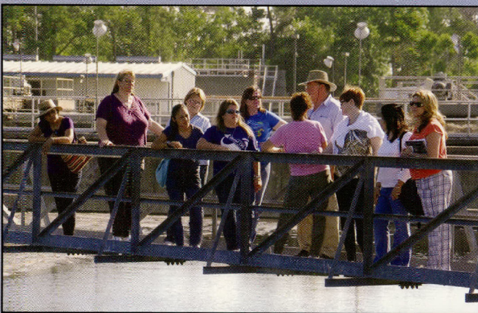
Teachers from Clear Creek ISD get first-hand knowledge of wastewater treatment at Blackhawk