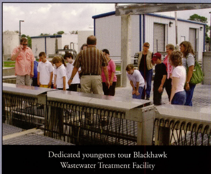
Dedicated youngsters tour Blackhawk Wastewater Treatment Facility