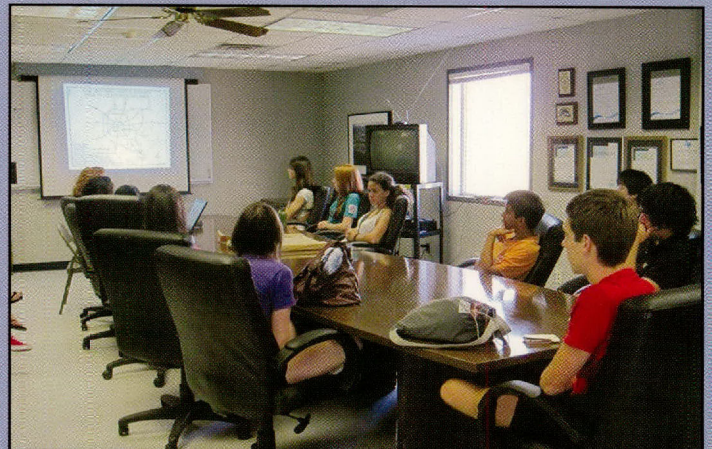
Students from Clear Lake High School review plant operations at the 40-Acre Facility