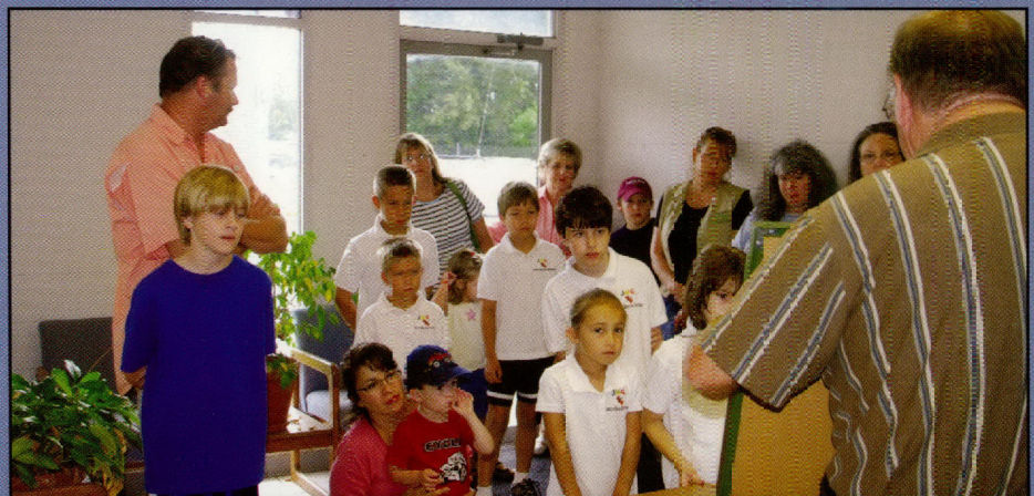
Junior Gardeners gather for the first part of their tour of the Blackhawk Facility.

The program seeks to teach leadership and life skills in addition to encouraging community service volunteerism.